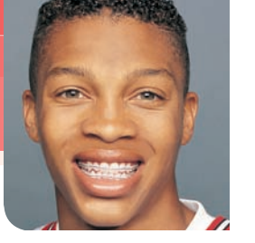
Clarity<sup>™</sup> Ceramic Braces